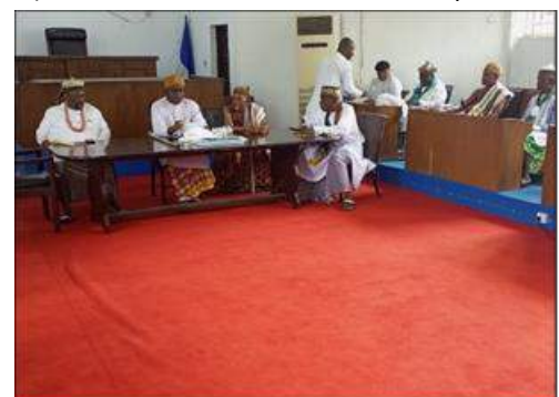
The Prevent Council and Cross River State Traditional Rulers Council mediation meeting

In continuation of the post-election phase of PIND's 2023 General Election Violence Prevention and Mitigation Project, Community Initiatives for Enhanced Peace and Development (CIEPD), one of the