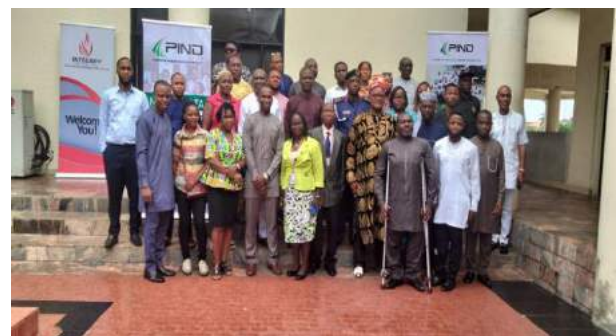
Town Hall meeting participants in Cross River State.