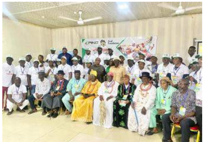
Cross Section of Participants in Bayelsa

In the previous quarter, PIND organized a capacity-building workshop for 30 participants from 15 NGOs and CSOs from Bayelsa, Delta and Ondo States to support the taking off of the Host Community Development Trusts (HCDT). This was to enable them to gain a better understanding of the Petroleum Industry Act (PIA) and their roles in ensuring the active participation of community stakeholders in the implementation process. In this quarter, a second workshop was held with 20 participants from 10 NGOs and CSOs from Akwa Ibom and Rivers states. This was facilitated by PIND and the New Nigeria Foundation.