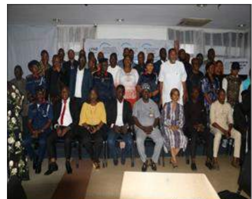
Participants at the 2023 General Election Debriefing Session in Port Harcourt, Rivers