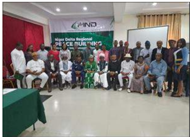
Town Hall meeting participants in Akwa Ibom State

Participants were drawn from wide spectrum of stakeholders ranging from the Ministry of Niger Delta Affairs (MNDA), Traditional institution, Community leaders (youth leaders, opinion leaders, women leaders), People With Disability (PWDs), Faith-based organizations(FBO), Local government representatives, Security agencies, Organized private sector (Unions, Chambers of Commerce, Artisan Groups), the academia, Ethnic Based Association, the media, Boat Riders, Nigeria Union of Road Transport Workers (NURTW), technicians, Keke and Okada Repairers Association (KORA) etc