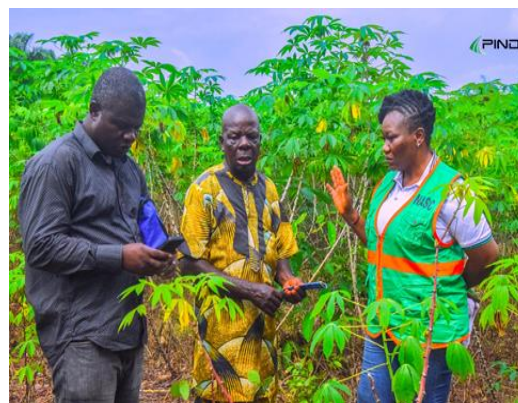
Figure 1: certification visit by National Seed Council (NASC) officials to Cassava Seed Entrepreneurs (CSEs)