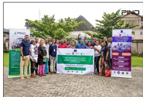
PIND facilitating Step-down Training on Conflict Transformation and Non-Adversarial Engagement for Community Youths in Rivers

Several key activities were carried out, including step-down capacity-strengthening training on conflict transformation and non-adversarial engagement for 382 youths (243 males, 139 females, and 7 persons with disabilities) across 26 project communities in 13 LGAs in Rivers State. In Bayelsa State, PIND facilitated social cohesion activities involving 385 participants (274 males and 111 females) from 16 project communities across 8 LGAs, engaging youths, community members, and government security actors. Additionally, in Delta State, PIND supported SFCG in facilitating Local Peace Architecture (LPA) meetings, which brought together stakeholders to identify conflict hotspots, discuss community concerns, and develop actionable plans to address these challenges.