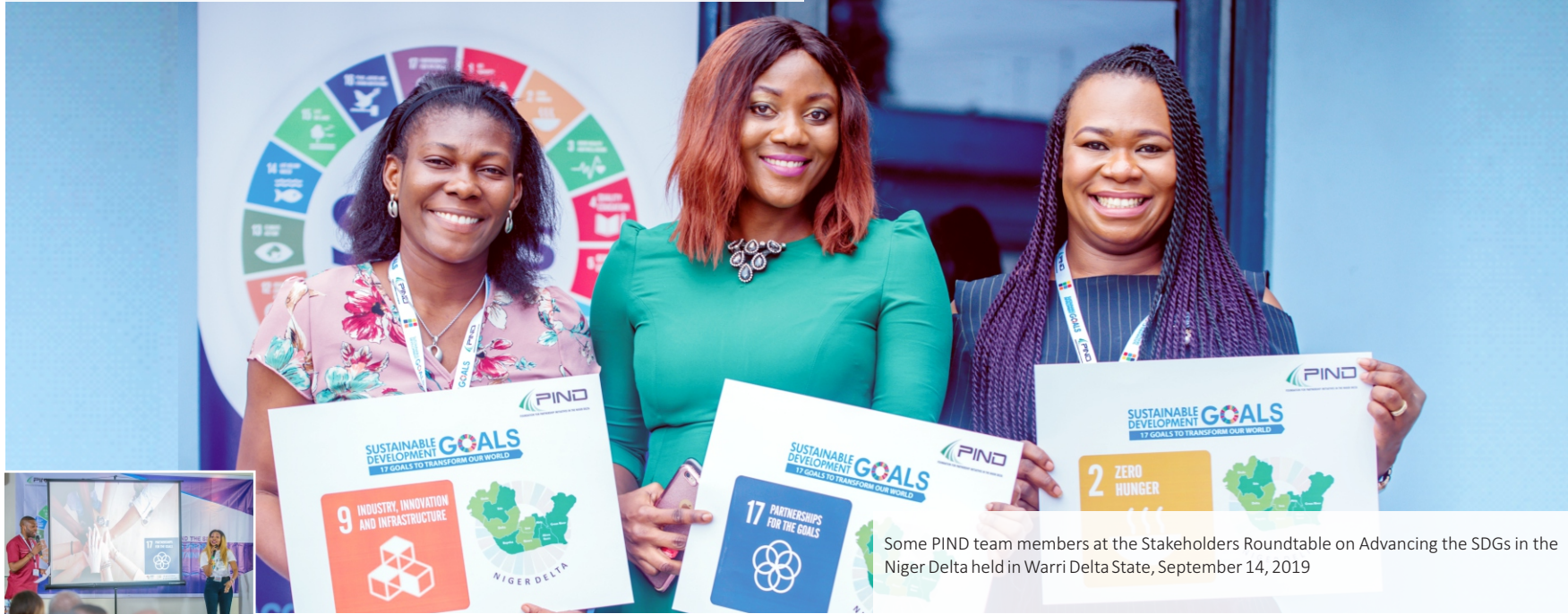
Some PIND team members at the Stakeholders Roundtable on Advancing the SDGs in the Niger Delta held in Warri Delta State, September 14, 2019