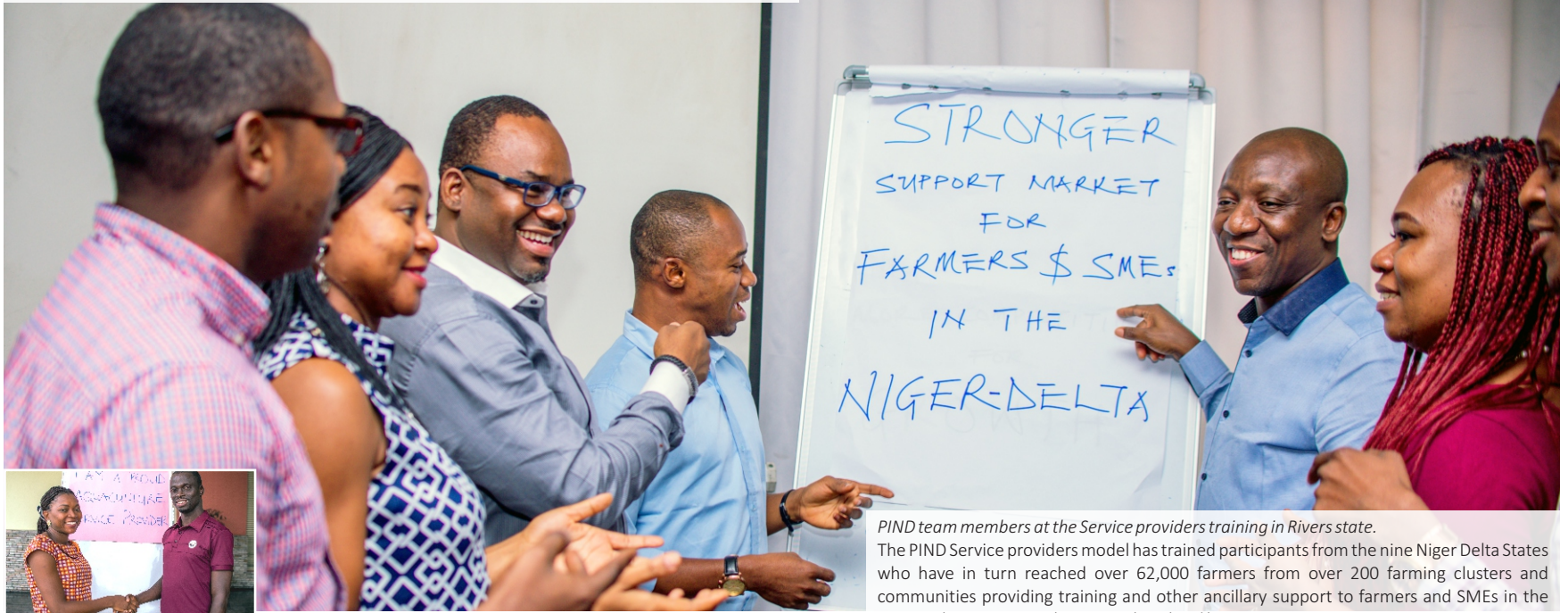
PIND team members at the Service providers training in Rivers state. The PIND Service providers model has trained participants from the nine Niger Delta States who have in turn reached over 62,000 farmers from over 200 farming clusters and communities providing training and other ancillary support to farmers and SMEs in the Niger Delta to improve their agricultural and business outcomes.