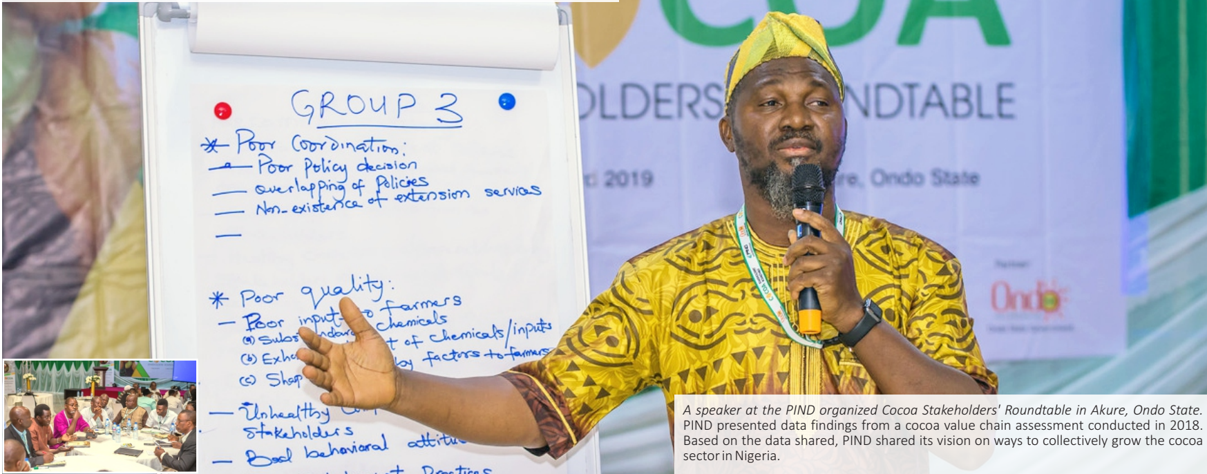
A speaker at the PIND organized Cocoa Stakeholders' Roundtable in Akure, Ondo State. PIND presented data findings from a cocoa value chain assessment conducted in 2018. Based on the data shared, PIND shared its vision on ways to collectively grow the cocoa sector in Nigeria.