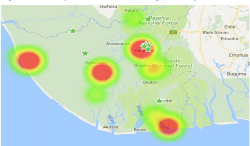
Figure 4: Heat Map of Incidents and Peace Agents in Bayelsa State

Heat Map shows concentration of incidents reported from July-September 2017 in Bayelsa; with green stars representing the registered Peace Agents.