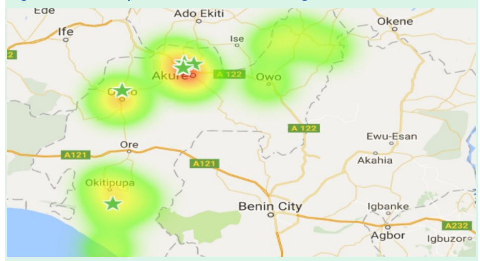
Figure 4: Heat Map of Incidents and Peace Agents in Ondo State

Heat Map shows concentration of incidents reported from February–April 2017 in Ondo, with green stars representing the registered Peace Agents.