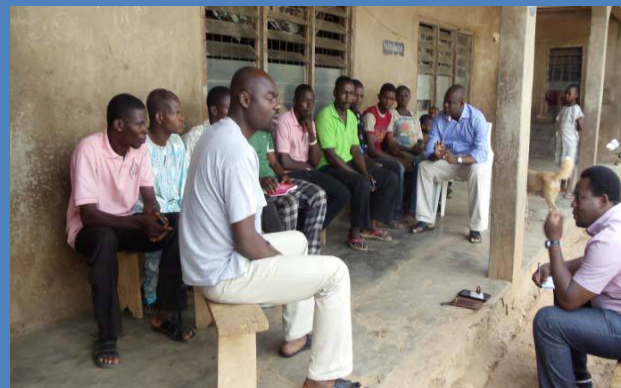
Pictured above are one of the consultations PIND's Economic Development team conducted as part of the cassava value chain scoping study.

In collaboration with Devex, PIND is progressing on developing the online portal "NDLink" that will be a one-stop-shop for Niger Delta development information as well as details of development projects and organizations. Preliminary market research is being planned to understand how NDLink can best meet the needs of the development community. Following analysis of the research findings, the design and implementation phase of the web-based portal will begin.