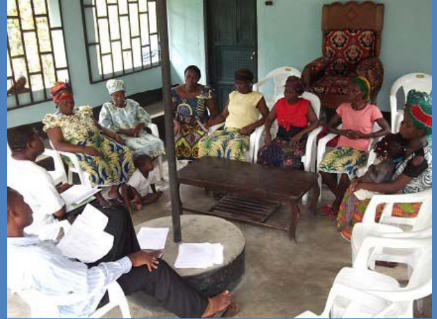
As part of their data collection, Aries Concept Nigeria Limited discussed with women from Ikot Akwa Ebom community in Akwa Ibom state the role of gender and how it impacts those living in the Niger Delta.

"If any woman is vocal at a meeting, she will be warned serious and reported to her husband. Women do not respond to town hall meetings. They will always say that whatever their husbands say is final or that their husbands should speak for them." – Community Gender Specialist