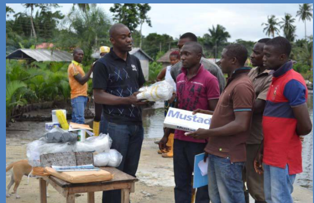
Members of the Deghele Fishing Association receive a Technical Assistance Grant (TAG) to improve their association's ability to catch fish which they rely upon for their livelihoods.