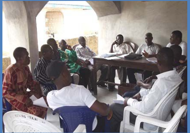
Discussion with men in Ntak Inyang community in Akwa Ibom state as part of the male Community Analysis session.