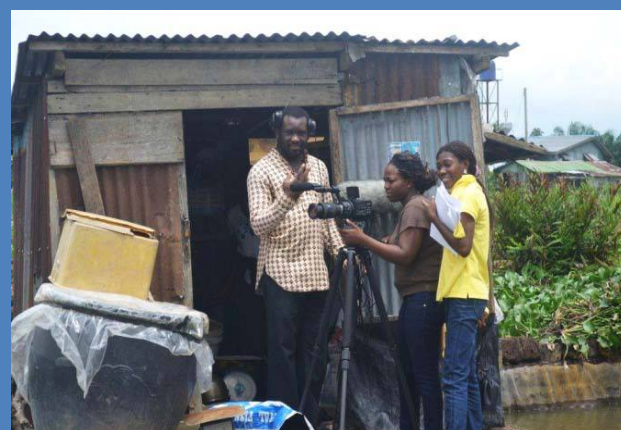
Members of the Media Production Hub team preparing to shoot footage at a fish farm as part of the value chain films that will promote understanding of the Niger Delta's aquaculture value chain.