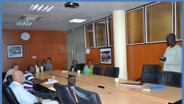
Aries Concept Nigeria Limited sharing their research with members of PIND. Analysis produced by the study will be used to continue mainstreaming gender issues into the design and implementation of PIND projects.