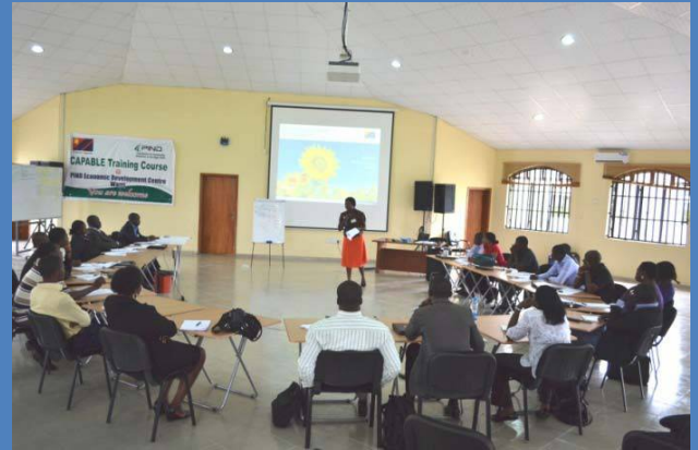
The first session of PIND's CAPABLE training focused on grant application and development with 20 participants from 10 CSOs representing five Niger Delta states.