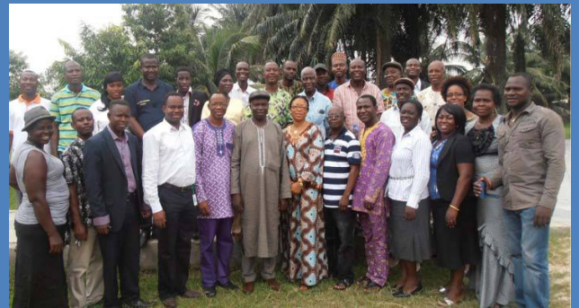
Members of the UUFA following the April strategic planning workshop that focused on building their internal capacity and developing a sustainability plan to guide their association's activities.