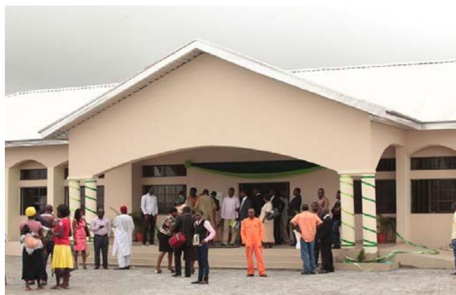
Guests gather during the EDC's official commissioning ceremony.

In addition, a fully equipped media production hub facility is located in the EDC where films to support and promote development efforts in the Niger Delta are currently being produced.