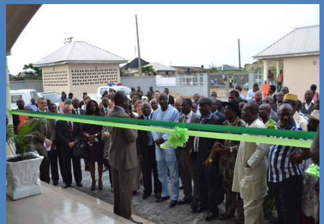
An array of guests from the development, government, and private sectors attended the EDC's official commissioning ceremony on May 9 th , 2012.

Cover Page Photo: PIND's Economic Development Center, commissioned in May 2012, will serve as a coordinating hub for development activity throughout the Niger Delta region.