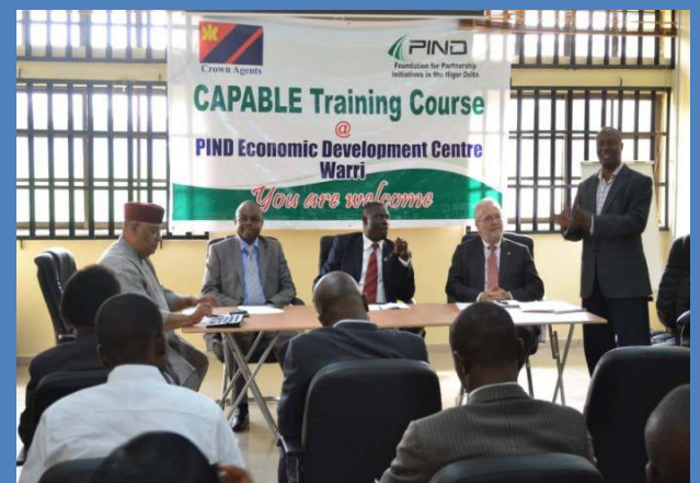
In partnership with the Crown Agents Foundation, PIND officially launched the first session of its CAPABLE training course in June. The project seeks to improve the skills of CBOs across the region.