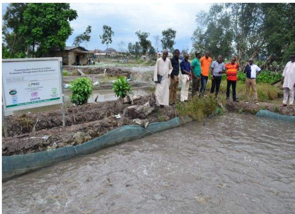
Photo: UUFFA farmers look on as an agricultural consultant discusses best practices in feeding catfish. The demonstration pond pilot project aimed at improving the efficiency of fish farmers' practices and, in turn, optimizing their profit-making potential.

Still in quarter 2, ahead of the visits, PIND's Media Production Hub produced a video featuring the process and activities of the demo pond intervention and feedback from the beneficiaries. The video was also screened to the potential partners during the visits to make the engagement more effective. The Delta State Commissioner for agriculture following the visit pledged the commitment of his ministry to partner with PIND in scale up of the demo ponds as well as the proposed Technical Training of