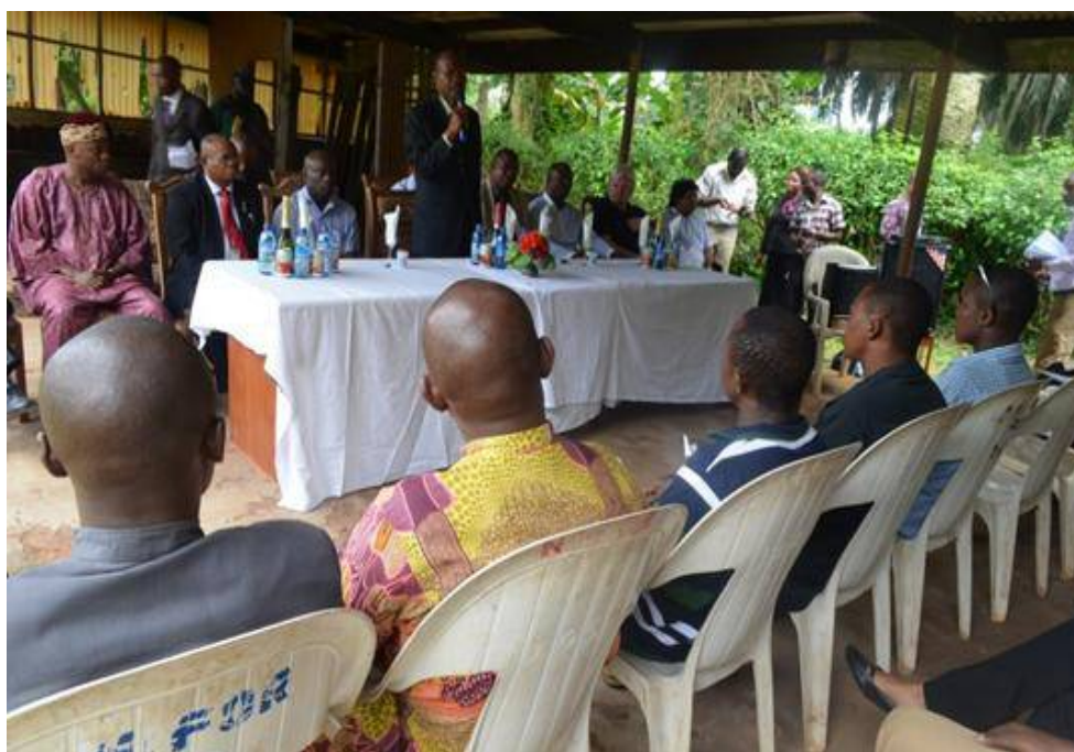
Photo: Fabricators from EziorsuOguta Palm Oil Farmers and Processors Association at their graduation ceremony at NIFOR. PIND facilitated a training of fabricators from the farming cluster in Imo State on how to make improved small-scale palm oil processing equipment that can extract up to 15% more palm oil than traditional methods of processing.

To facilitate the promotion of the NIFOR improved milling technology sustainably, PIND and NIFOR with support from PIND's ATED team identified 6 fabricators around the pilot cluster who are skilled in production of the current basic processing equipment. In June, NIFOR trained the 6 small-scale oil palm processing machinery manufacturers on how to create simple and appropriate technology to boost palm oil processing in the Niger Delta. Through this training, PIND facilitated the