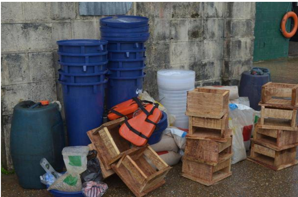
Photo: Parts of the bio-sand filter waiting to be assembled. The bio-sand filter, like all appropriate technologies, is made of locally-available materials and is ideal for use in communities throughout the Niger Delta

As a follow-up to the Training of Trainers training on the bio-sand filter as a micro-enterprise held in February, a local NGO, CMADI was mentored during the second