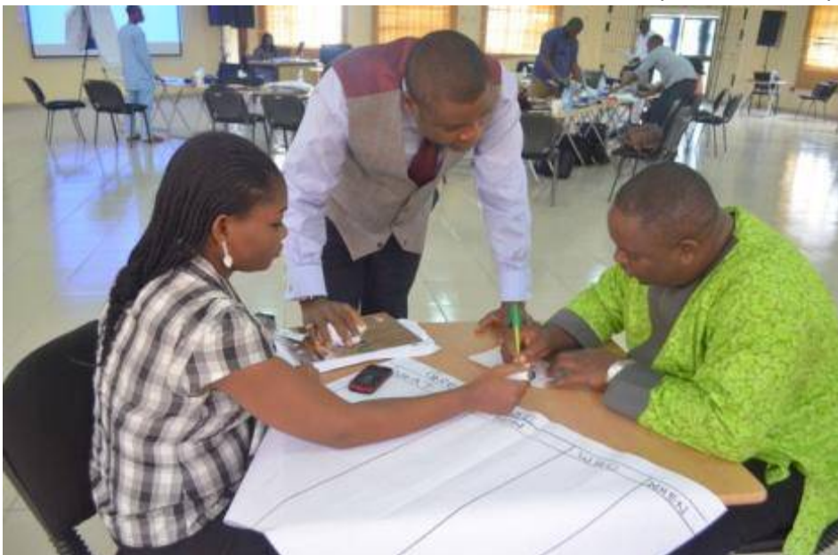
Photo: CAPABLE training on Financial Management and Reporting marked the end of the pilot phase of the project

In June, a participatory evaluation of the CAPABLE Training was held with 25 participants (19 males, 6 females) drawn from the 3 batches who had completed the 3 modules of the training course. The purpose of this evaluation was to assess the process, outcomes and impacts of the pilot CAPABLE project within the context of