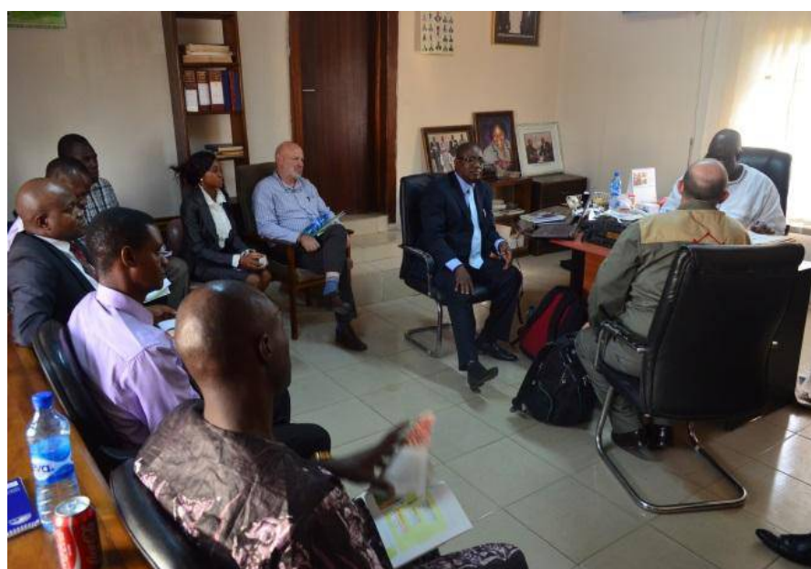
Photo: PIND team engaged the Edo State Commissioner for Agriculture on an out-grower scheme that will enable more smallholder farmers to have more consistent demand for their harvest

Having increased cassava farmers' knowledge of the economic benefit of cultivating cassava varieties with high starch content through a starch testing exercise for farmers in Edo state in the last quarter, PIND saw an increased adoption of new high starch yielding cassava varieties by farmers in quarter 2. 6 cassava farmers requested for high yielding cassava varieties with high starch content and 80 bundles of stem cuttings of the new improved variety were supplied in the reporting quarter. A concept for rapid stem multiplication for the high yielding cassava variety is to be developed in the third quarter.