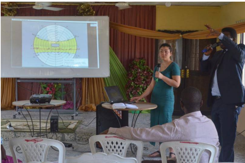
Photo: the ATED Centre concept was shared with the community during the quarter to get their buy-in. PIND aims to give as many community persons as possible the opportunity to participate in the construction process, learn new skills and gain employment

In 2012, The ATED team provided support for evaluation of applications from schools in Port Harcourt and Owerri for the Schlumberger Excellence in Education Development (SEED) program's selection of four schools to receive