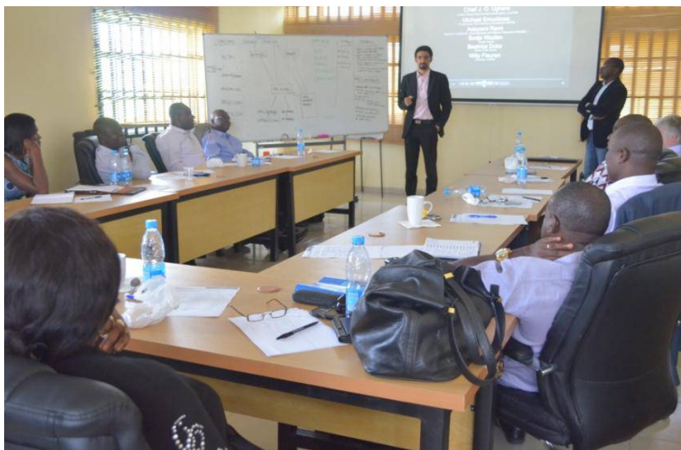
Photo: Staff of CNL trained on the principles of systemic market development during the Value Chain Analysis Training. Collective Feedback from the participants at the end of the training show that the market development approach will help them in both the design and execution of development strategies

The team also re-designed the curriculum used for the value chain training in response to feedback from previous trainings.