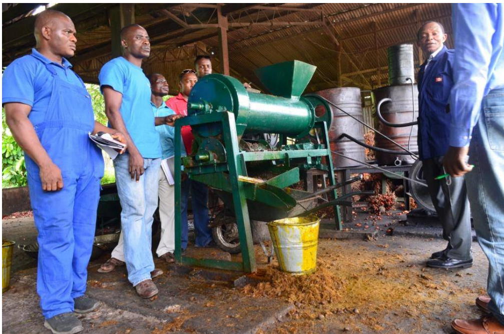
Photo: Trained fabricators display the small-scale palm oil processing equipment they manufactured. The technology can extract up to 15% more palm oil than traditional methods of processing

There is already a clear demand for the equipment as an NGO in Akwa Ibom State is demanding for all 20 pieces of the equipment ordered. Sterling Bank is interested in investing in the machine for the cluster of palm oil farmers in Edo State while palm oil clusters in Imo State are already awaiting the