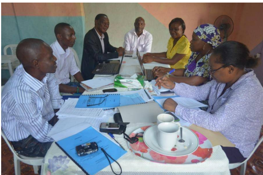
Photo: PIND conducted a pre-award assessment of CMADI as a proposed co-facilitator of the PLACE project

Following the concept development of Peace Camp as an annual forum for peace building actors in the Niger Delta to share information, recognize their contributions to peace and plan for continued peace building initiatives done in quarter 1 by the PIND team, the P4P team focused their efforts in quarter 2 to advancing plans for the Camp and commenced the selection of potential participants at the Camp. The selection of participants and logistics will be