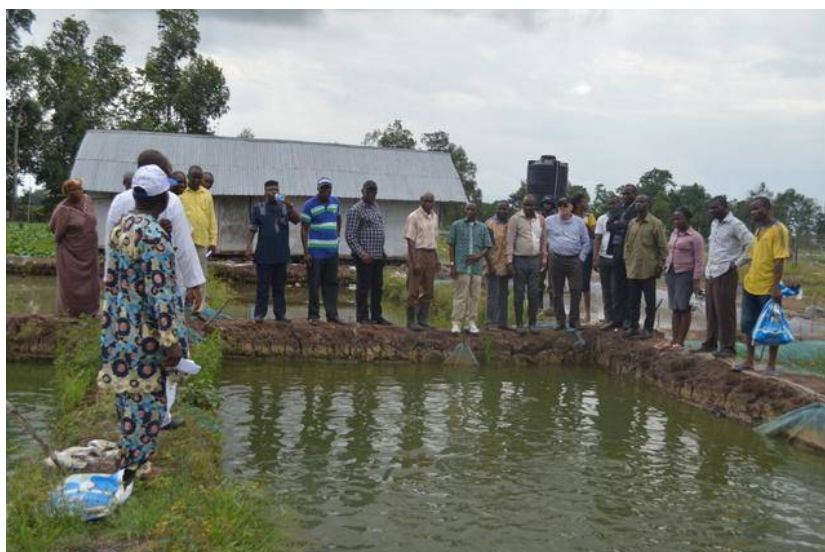
Photo: PIND team facilitated a tour of the demo pond intervention site for the Delta State Commissioner for Agriculture, and potential and current partners.

In pursuance of its objective to improve cassava market by linking farmers to