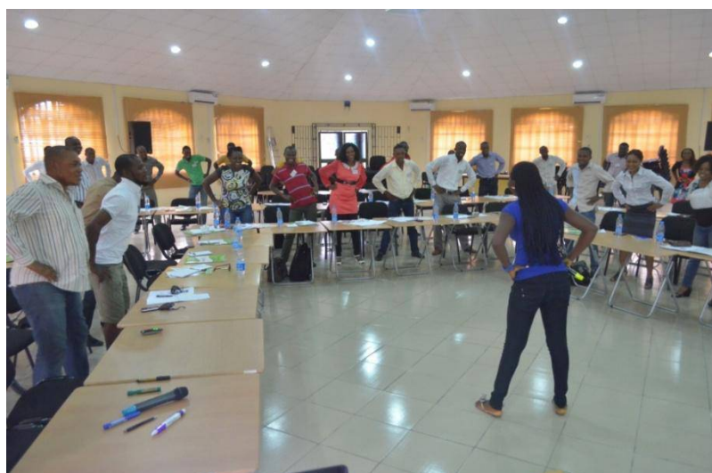
Photo: Warm-Up session during the Youth Leadership training. 36 youth learnt skills in leadership, entrepreneurship and communications during the quarter

In April, PIND participated in a Niger Delta Stakeholders' Conference where the printed Niger Delta Action Plan was distributed to a wide range of audience. Over 400 people including traditional leaders, CSOs, religious leaders, legislators, women leaders, ministries, departments, agencies, youth leaders, development partners and the media attended