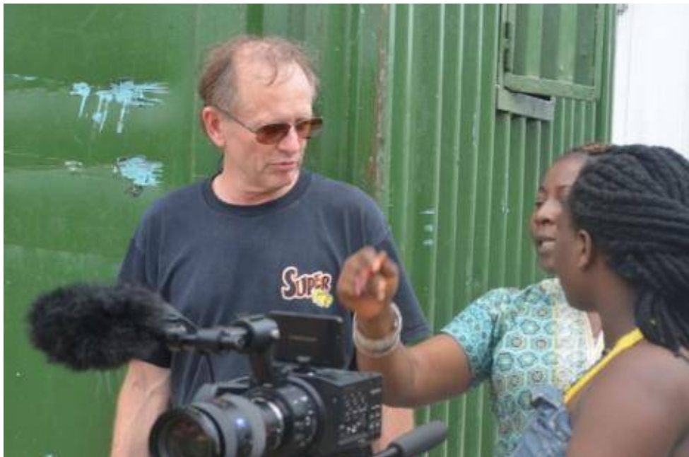
Photo: PIND improved the capacity of 14 Niger Delta youth on the advanced use of the camera for telling powerful development related stories

Follow on to the meeting, the ATED team held a training program to support formation of the Water & Sanitation Rotarian Action Group