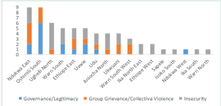
Figure 2: Trends in Conflict by LGA (Feb - Apr 2016)

Reported incidents by Local Government Area (LGA), in Delta State this quarter show that Ndokwa East and Oshimili South had the most incidents of conflict risk and violence.