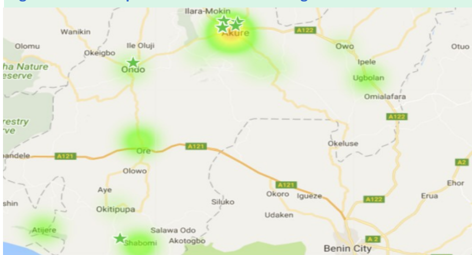
Figure 4: Heat Map of Incidents and Peace Agents in Ondo State

Heat Map shows concentration of incidents reported from September–November 2017 in Ondo, with green stars representing the registered Peace Agents.