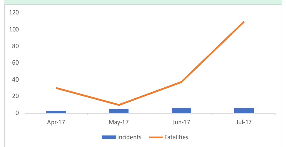
Figure 1: Conflict Incidents and Fatalities, Cross River State

Reported incidents and fatalities from April – July 2017 in Cross River State.