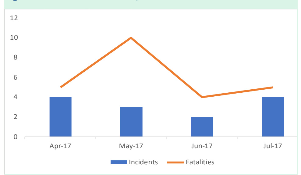
Figure 1: Incidents and Fatalities, Abia State

Reported incidents and fatalities from April –June 2017 in Abia State.