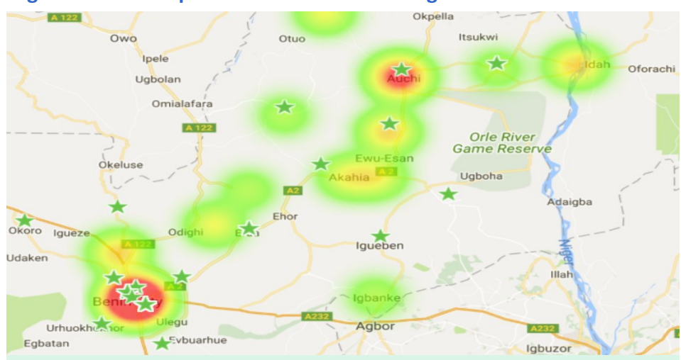
Figure 4: Heat Map of Incidents and Peace Agents in Edo State

Heat Map shows concentration of incidents reported from April-June 2017 in Edo State; with green stars representing the registered Peace Agents.