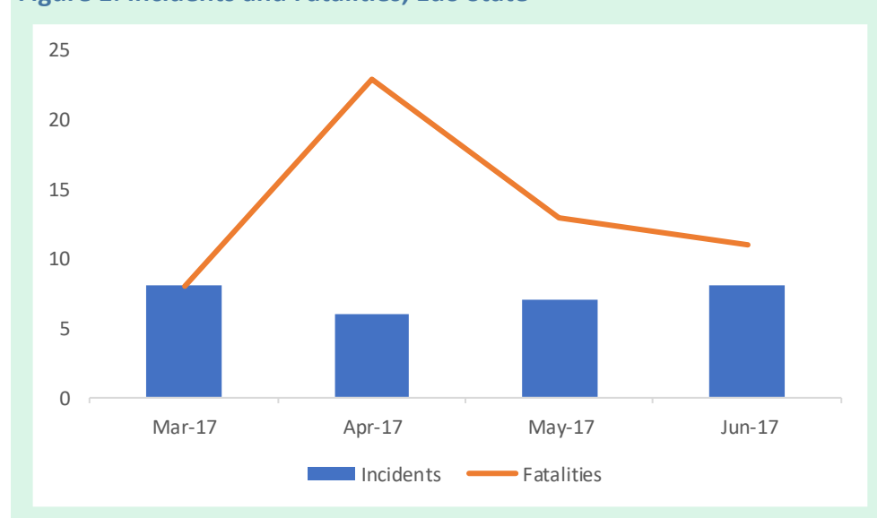
Figure 1: Incidents and Fatalities, Edo State

Reported incidents and fatalities from March—June 2017 in Edo State.