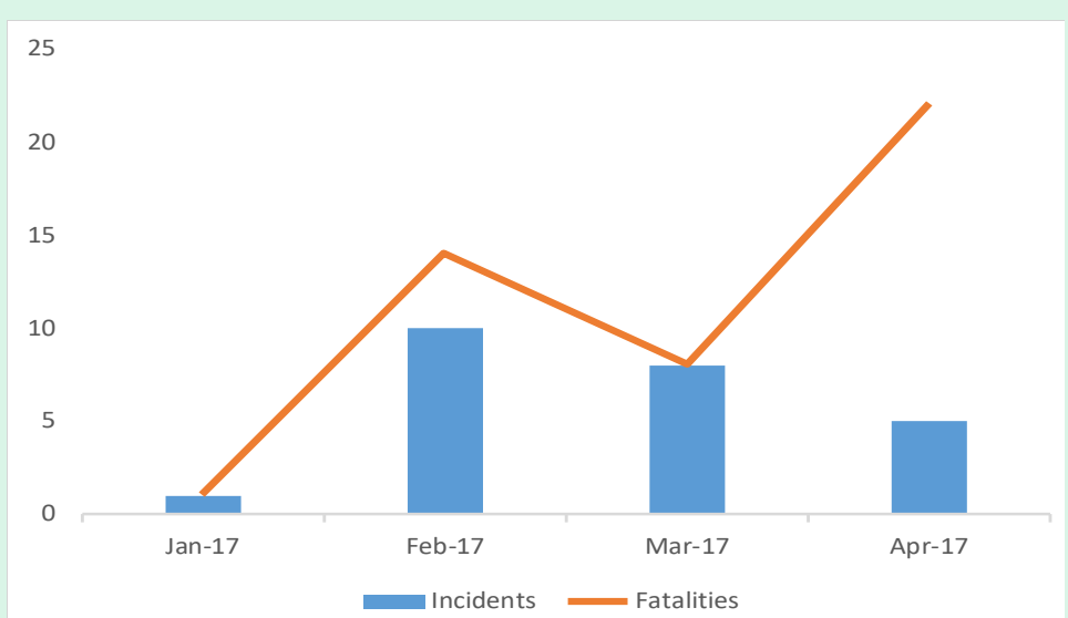
Figure 1: Incidents and Fatalities, Edo State

Reported incidents and fatalities from January—April 2017 in Edo State.