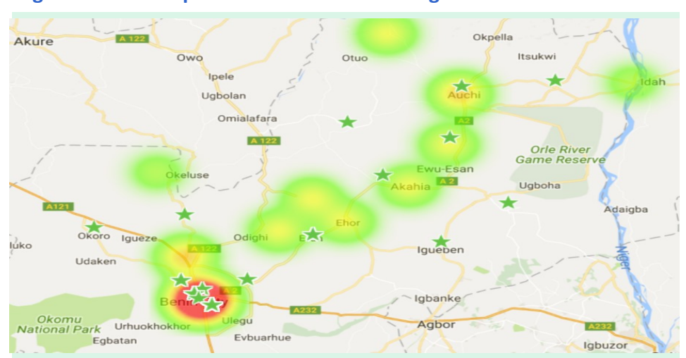
Figure 4: Heat Map of Incidents and Peace Agents in Edo State

Heat Map shows concentration of incidents reported from February-April 2017 in Edo State; with green stars representing the registered Peace Agents.