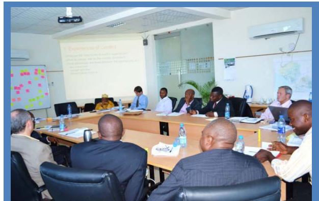
PIND staff and local partners collaborating during the P4P analysis workshop to identify key findings and propose recommendations following the FGD and KII data gathering exercise.