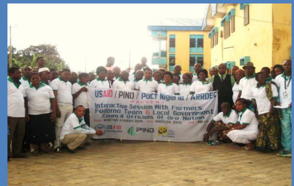
Participants of the Antof Rural Resource Development Centre (ARRDEC) Forum held in Mbo LGA, Akwa Ibom State.