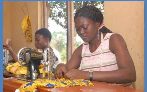
A member of the Dynamic Ladies Association, an all female charity youth group that received a Technical Assistant Grant (TAG) in the Q1 to expand their micro finance scheme.