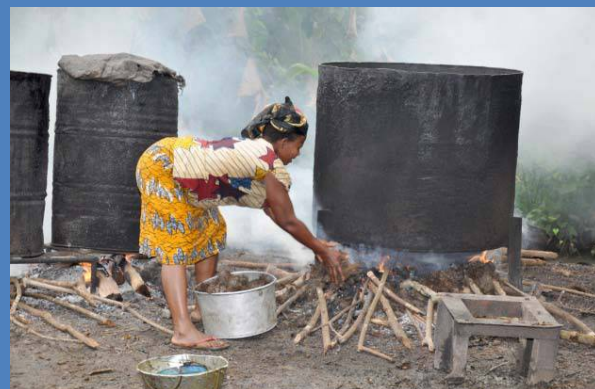
PIND's Economic Development team continues investigating ways to improve opportunities in the palm oil sector which an estimated 2 million people in Nigeria rely upon for their livelihoods.