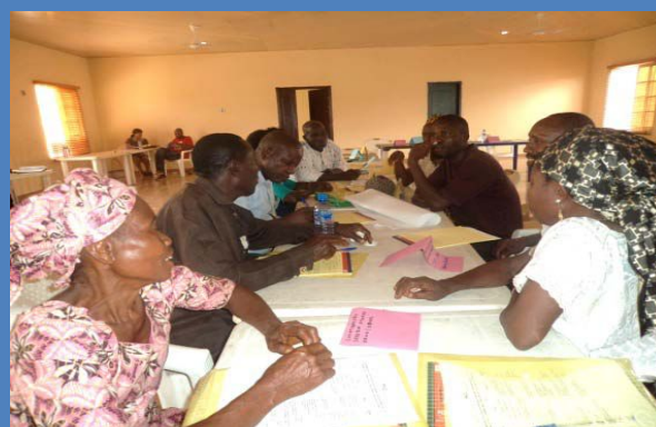
A subgrantee of the ADVANCE program, the Community Initiative for Enhanced Peace and Development (CIEPD), organized 15 education forums such as the one pictured above.