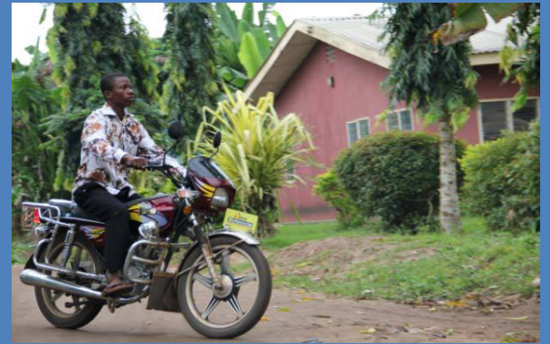
Pictured above is a member of the Umuokanne Youth Transport Association. The association is a self-help group in Imo State and recipient of PIND's Technical Assistant Grants (TAG).