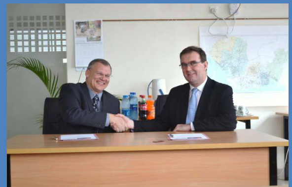
In February, PIND and Crown Agents (CA) signed an MOU to partner on PIND's Capacity Building for Local Empowerment (CAPABLE) project.