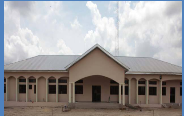
PIND's Economic Development Center (EDC) will serve as a coordinating hub for development activity throughout the Niger Delta.

Cover Page Photo: Women of the Niger Delta, such as the one pictured, struggle to earn a living in the midst of poverty and conflict. PIND's Economic Development and Peacebuilding programs seek to improve opportunities for individuals like her throughout the region.