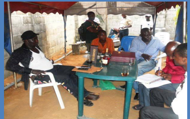
Various demographics of local community members, including women, youth, and ex-militants, were interviewed as part of the P4P data gathering exercises conducted to better understand conflict within the region.