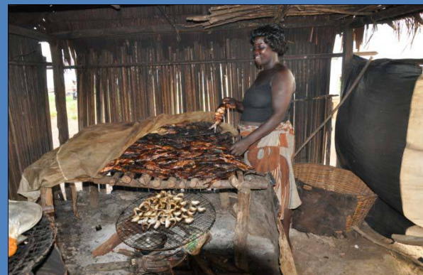
PIND's ATED program is exploring ways of improving fish smoking techniques for those whose livelihoods depend on it.