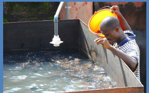
A member of the Wordful Farm Cooperative Society, a recipient of PIND's Technical Assistance Grant (TAG), feeding catfish fingerlings. The organization used its TAG funding to purchase two storage tanks which now supply fresh water to their aquaculture operations.