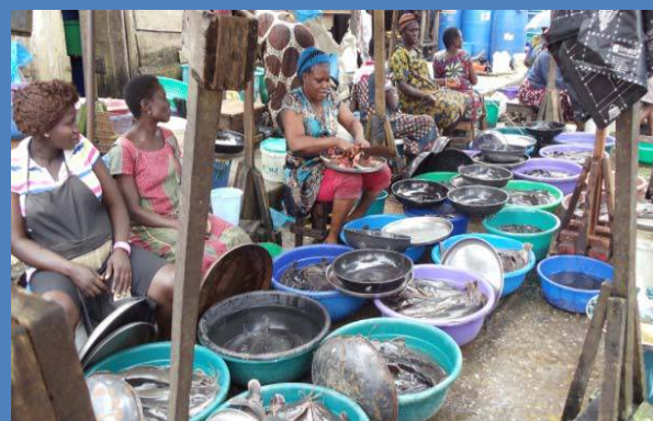
"Fish mummies" selling fresh fish in the markets. PIND's aquaculture value chain project is exploring a variety of ways to generate new opportunities for poor people throughout the value chain.