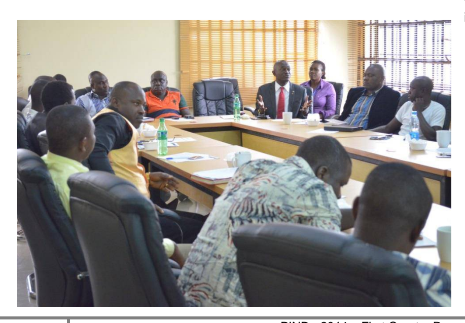
Photo: Business linkages strategy session with stakeholders in progress

may require to further inform the pilot design.