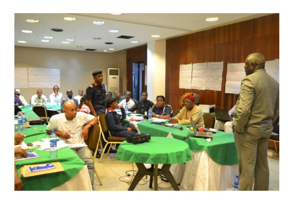
Photo: A civil defense corps officer talks to the facilitator of the P4P Conflict Assessment Tools (CAST) workshop about conflict in his community in Imo State

✓ Conflict Assessment training conducted for Peace Networks in the Niger Delta