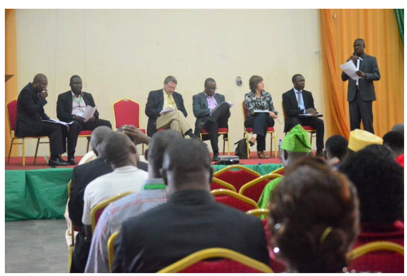
Photo: Panelists discuss MSME development at the Foundation's second annual Niger Delta Development Forum that held in Benin, Edo State

NDLink has exceeded over 100,000 page views (137,808 at the end of March), with a record of 2, 076 page visits on February 4, 2014.