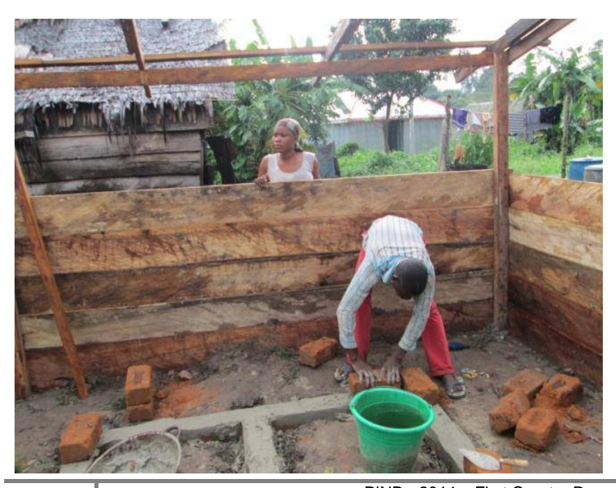
Photo: A member of the Keffes RDC community building the structure for the chorkor oven, a clean-burning stove that helps smoke more fish at a time with less pollution and energy

Following the successful disbursement of the loan, UUFFA entered into partnership with Grand Cereals