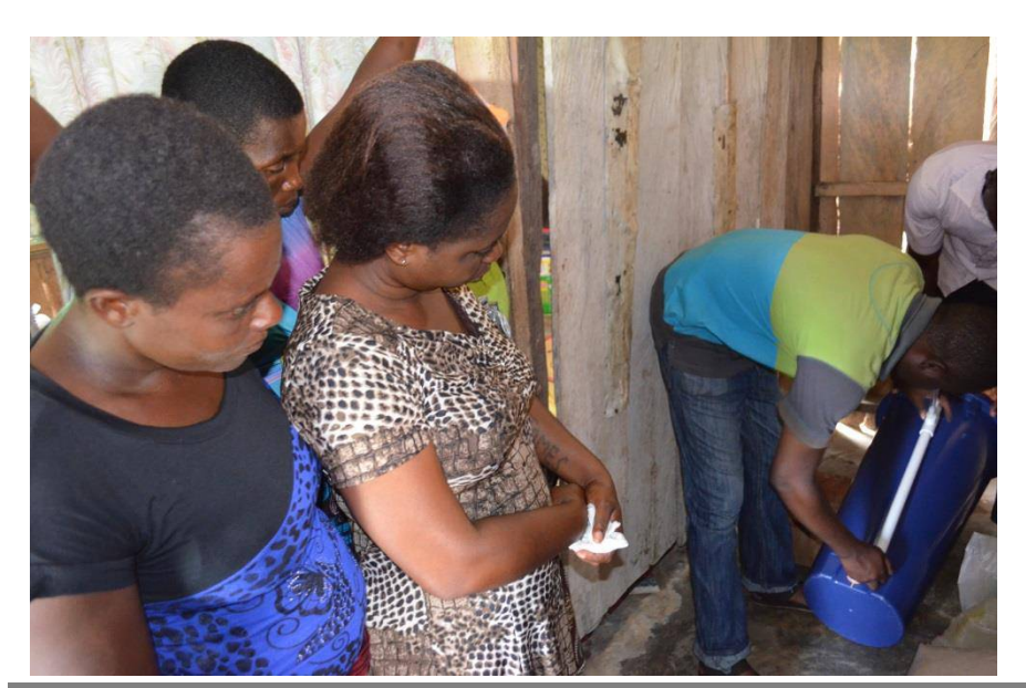
Photo: Bio-sand filter being installed in rural households as a simple source of clean potable water

The quarter also produced trained trainers from the community who demonstrated the skills and knowledge to install and operate the bio-sand filters, while 60 filters are already installed and in use by the community