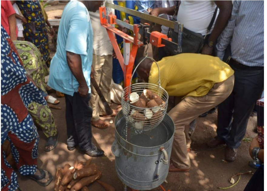
Photo: Edo State Farmers test their starch content of their cassava using starch testing kits provided by Thai Farms. Only high starch content cassava tubers are used by cassava flour mills, among other industrial users of cassava

PIND's palm oil pilot project continued this quarter to promote knowledge sharing of good