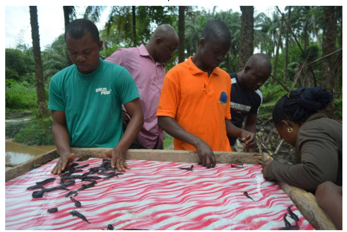
Fish farmers in the scale-up of the demonstration pond project sort fingerlings for their ponds. Six demonstration ponds were established in partnership with Grand Cereals in Asaba and Ughelli, Delta State.

information from the farmers ahead of the scale-up, which will be useful in assessing the project's impact.