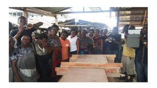
There are now 8 chorkor ovens in use, each serving 20 women. That's a total 160 women now using the machine at this time