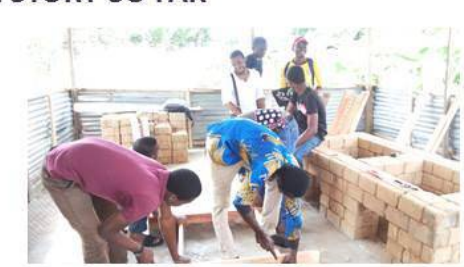
4 Trainees from Morgan Smart Development Foundation learned how to construct the oven