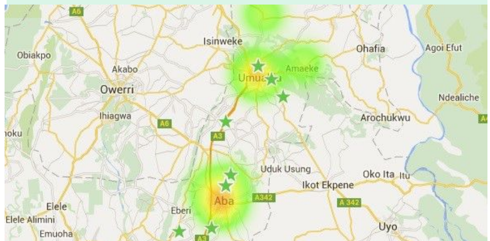
Figure 3: Heatmap of Incidents and Peace Agents in Abia State

Heatmap shows concentration of incidents reported from Feb - Apr 2016 in Abia State; with green stars representing the registered Peace Agents.