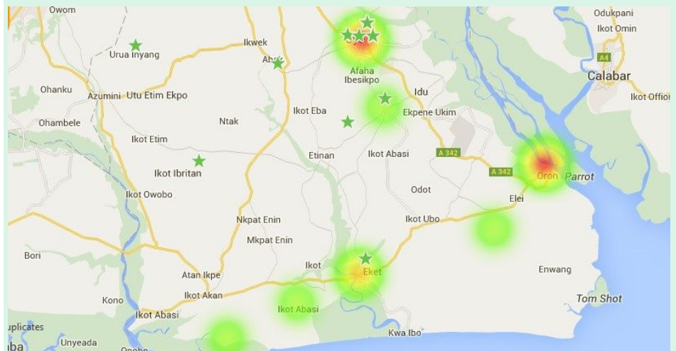
Figure 3: Heatmap of Incidents and Peace Agents in Akwa Ibom State

Heatmap shows concentration of incidents reported from Feb-Apr 2016 in Akwa Ibom; with green stars representing the registered Peace Agents.