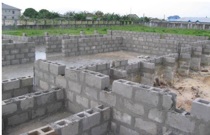
Economic Development Center under construction in Warri