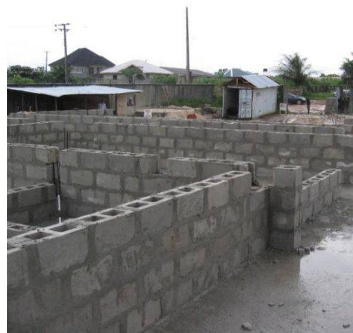
The Economic Development Center at Warri currently under construction.