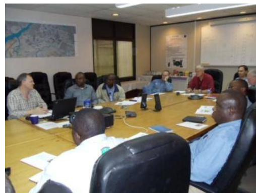
PIND Management team briefs the Operations Leadership Team of Chevron at Escravos on the progress and plans of the Initiative.