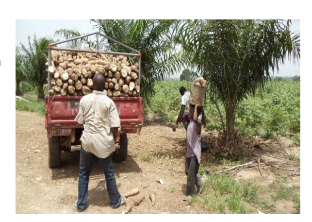
Harvested cassava being moved from the farm to the markets.

To overcome those constraints and develop a more competitive and sustainable cassava value chain PIND's pilot project interventions will focus on: