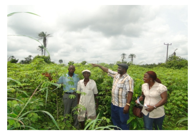
Site visits were conducted with different stakeholders along the cassava value chain as part of PIND's scoping study.

Cassava production and processing is a diverse and widespread activity in the Niger Delta, involving small, medium and large-scale producers and processors. It provides employment and income for over 80% of the rural poor. About 70% of cassava farmers in the region are women and they are almost entirely responsible for the processing and marketing aspects of production. Cassava thus has tremendous potential to improve the lives of low income, rural farmers, processors, and their families and increase food security within the region.